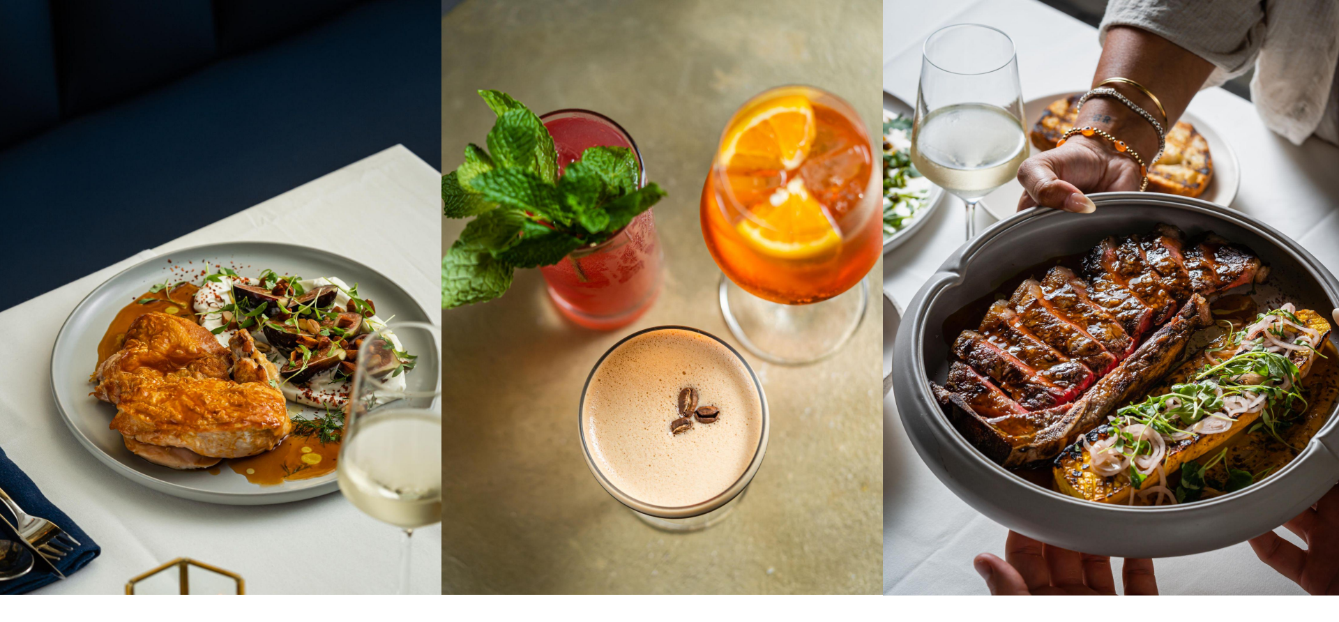
A party without alcohol is just a meeting. Don't make it a meeting